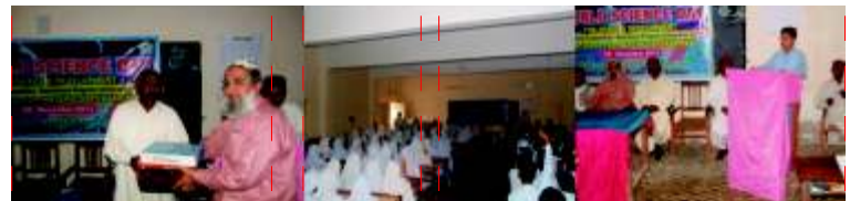
Glimpses of World Science Day Celebrations by Sukkur Unit.