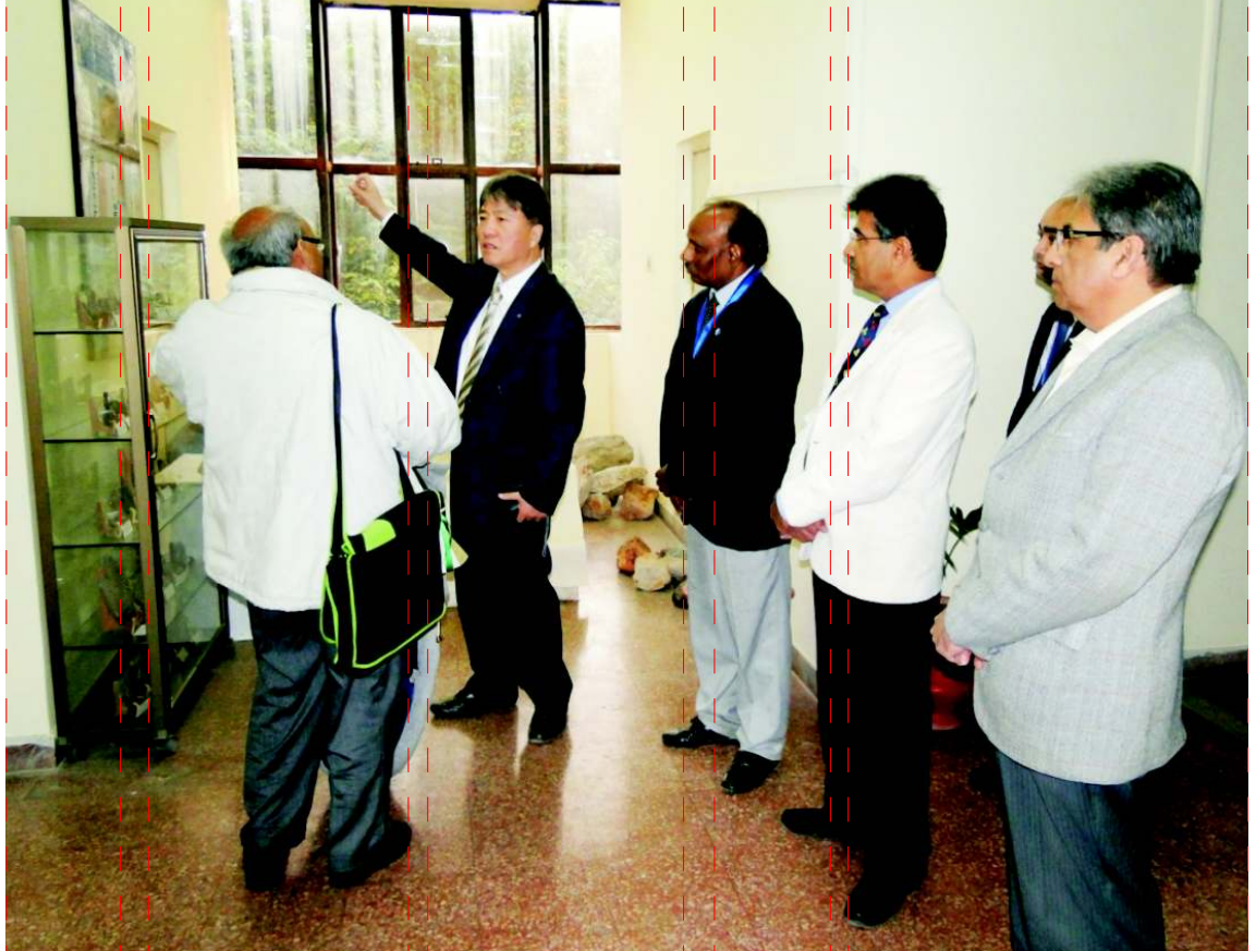
UNESCO delegation visiting PMNH on 28 th November, 2013