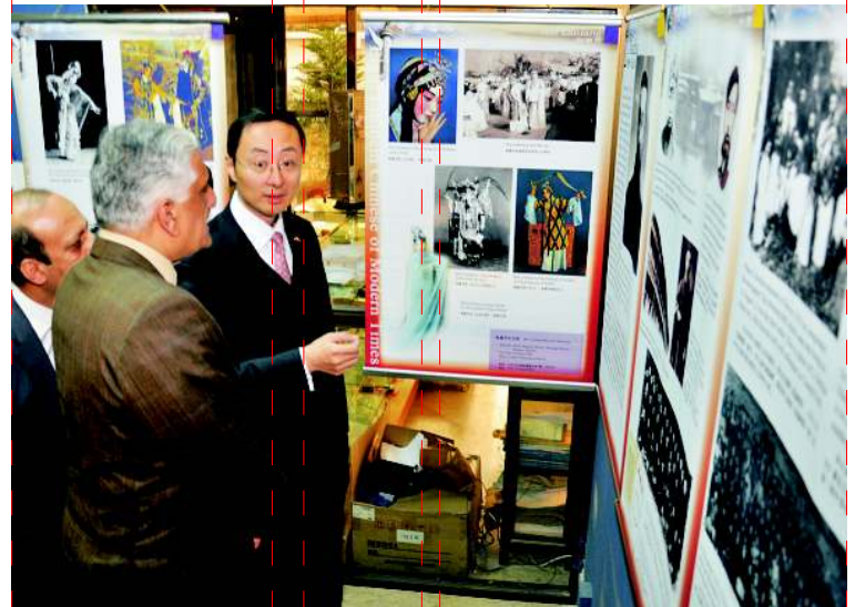
Chinese Ambassador H.E. Sun Weidong and Federal Minister for S&T Mr. Zahid Hamid visit the exhibition.