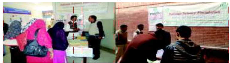
Glimpses of PASTIC S&T Services Stalls at Faisalabad.