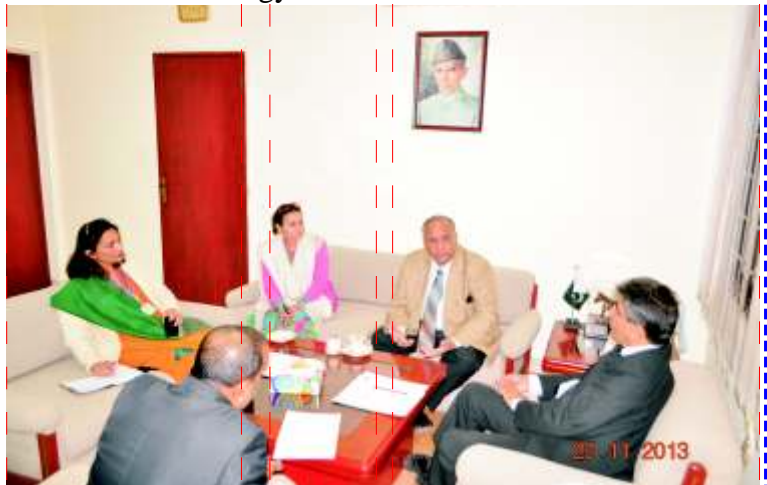
Meeting of Chairman PSF with Chairman E-Village Foundation.