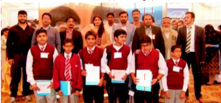
A group photo of award winning team of Pak-Turk International School with PSF Science Caravan and Intel officials.