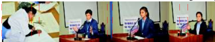
A view of Poster and Speech Competitions on the occasion of World Science Day in Islamabad.

He said the purpose of World Science Day is to renew the commitment to science for peace and development and to stress the reasonable use of science for the benefit of society