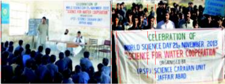
Glimpses of World Science Day Celebrations in Jaffarabad.