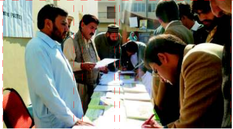
Glimpse of PASTIC S&T Services Stall at KPK Agriculture University, Peshawar.