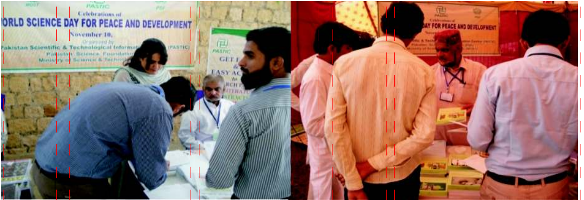
Glimpses of PASTIC S&T Services Stall in Karachi.

PASTIC Sub Centre, Karachi organized a services stall during three days 1 st International Coal Conference held on November 7-9 th , 2013 at Mehran University of Engineering and Technology, Jamshoro. A large number of participants visited PASTIC stall for their acquaintance about its S&T services.