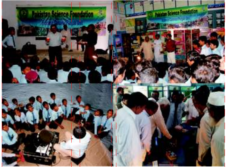
Glimpses of Science Exhibition at Khanewal

Jaffarabad Unit: A science caravan exhibition was arranged at Govt. Boys High School Dera Allah Yar on November 18-25 by the